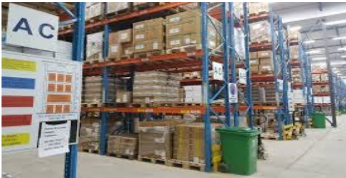
Premiere Warehouse Lagos